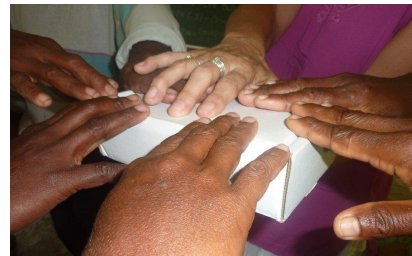
Prayer for the effective use of the Saber player.