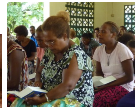
Reading the Solomon Is. Pijin Bible at the KYB workshop, Loina, north Malaita.

northern region of Malaita. 70 people from different churches attended the two-day workshop and several KYB groups were formed.